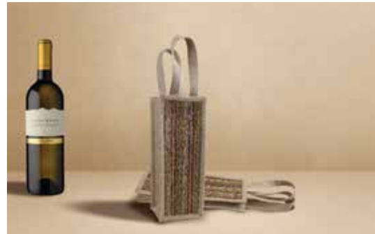
HTS007 Eco Shopper