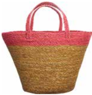
HSPS001 Eco Shopper