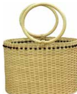
HSPS024 Eco Shopper