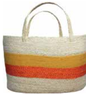
HSPS002 Eco Shopper