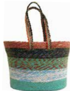
HSPS032 Eco Shopper