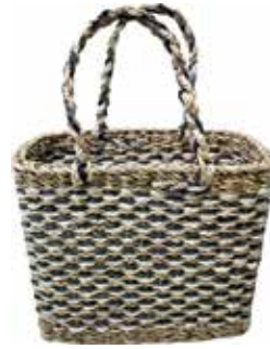
HSPS011 Seagrass, Recycle Fabric Eco Shopper Handmade