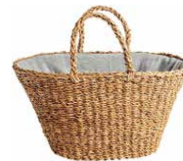
HSPS015 Eco Shopper