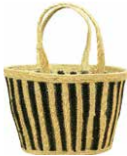
HSPS029 Seagrass, Jute Eco Shopper Sewing