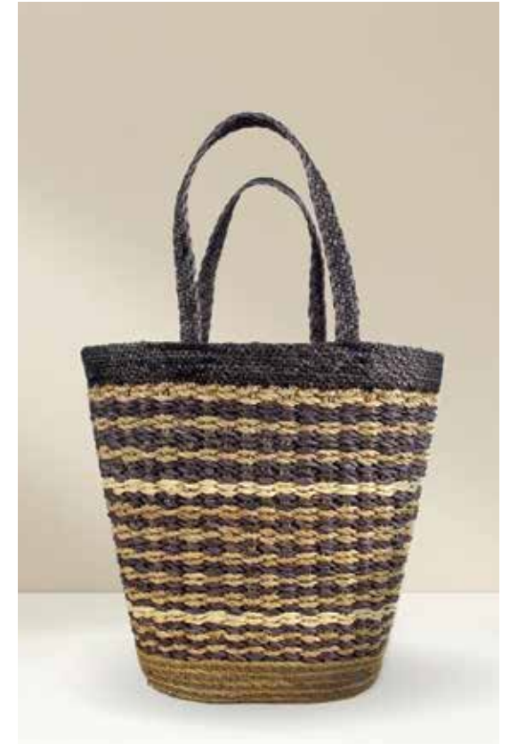
HTS016 Seagrass Eco Shopper Handmade