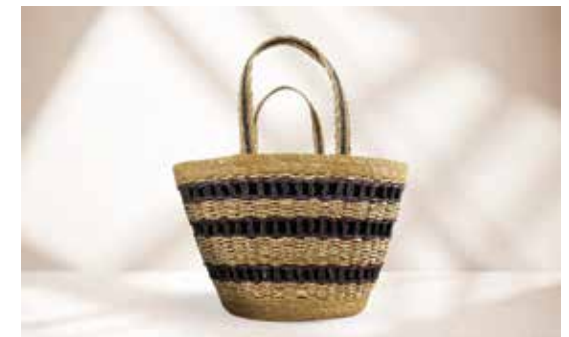
HTS010 Seagrass Eco Shopper Handmade