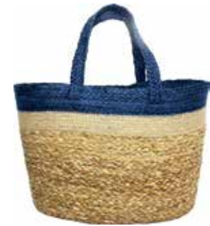
HSPS005 Eco Shopper