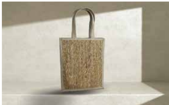
HTS006 Eco Shopper

D 12x25 x B 12x25 x H 30, h 19x14 g 11 cm