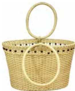
HSPS025 Eco Shopper