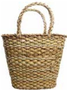
HSPS004 Seagrass, Jute Eco Shopper Handmade