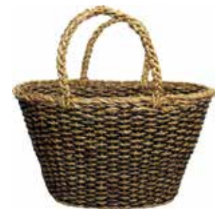
HSPS003 Seagrass Eco Shopper Handmade