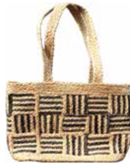
HSPS030 Jute Eco Shopper Sewing