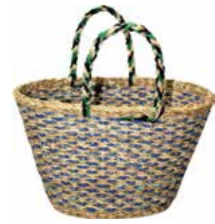
HSPS012 Seagrass, Recycle Fabric Eco Shopper Handmade