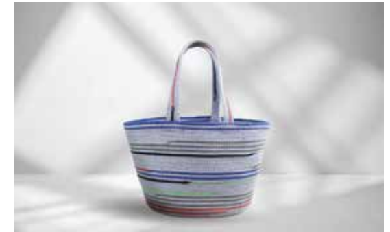
HTS008 GRS Certified Drawstring Eco Shopper Sewing

L: D 38x21 x B 34x23 x H 29.5, h 16x26 cm M: D 33x19 x B 29x19 x H 26, h 15x22 cm S: D 27x18 x B 25x16 x H 23, h 13x19 cm