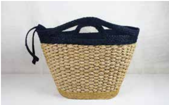
HTS011 Seagrass, Jute Eco Shopper Handmade