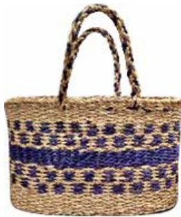
HSPS007 Seagrass, Recycle Fabric Eco Shopper Handmade