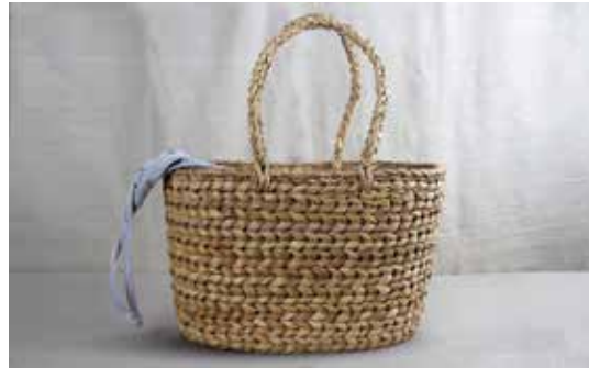
HTS003 Seagrass Eco Shopper Handmade