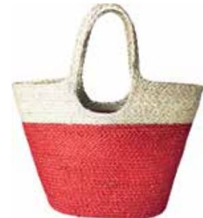
HSPS020 Eco Shopper