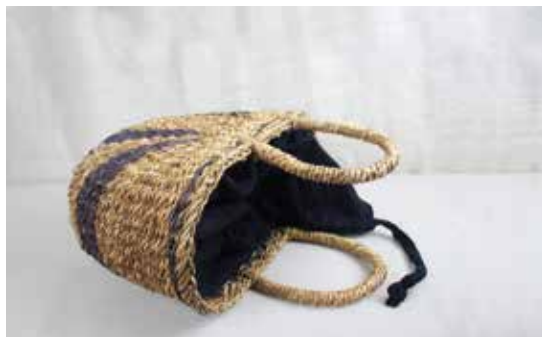
HTS001 Seagrass Eco Shopper Handmade

L: D 45x23 x B 30x20 x H 27, h 22x17 cm S: D 40x18 x B 28x16 x H 23, h 22x17 cm