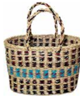
HSPS008 Seagrass, Recycle Fabric Eco Shopper Handmade