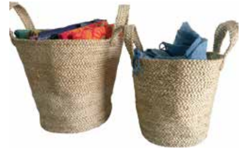
HSPS034 Eco Shopper