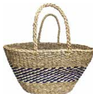
HSPS014 Eco Shopper