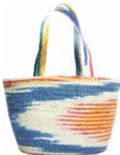
HSPS031 Eco Shopper