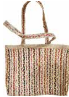
HSPS033 Eco Shopper