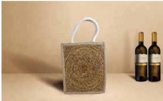
HTS005 Eco Shopper

"Our new collection,Eco-Chic Wine Bags for Stylish and Sustainable Carrying."