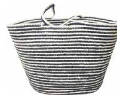
HSPS021 Eco Shopper