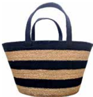
HSPS016 Eco Shopper