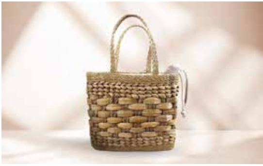
HTS004 Seagrass Eco Shopper Handmade