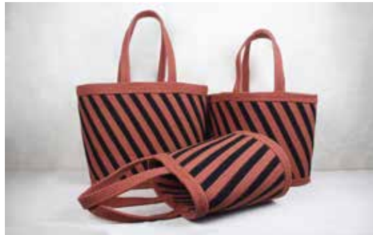
HTRD014 GRS Certified Drawstring Eco Shopper Sewing

"This year's eco-shopper collection is here! Thoughtfully designed, eco-friendly, and ready to carry your essentials in style."