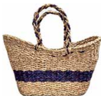
HSPS013 Eco Shopper