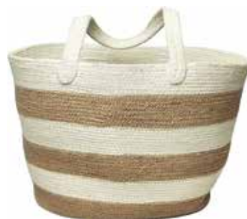
HSPS023 Eco Shopper