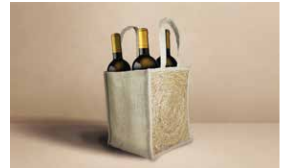
HTS013 Eco Shopper