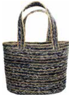
HSPS010 Seagrass, Recycle Denim Eco Shopper Sewing