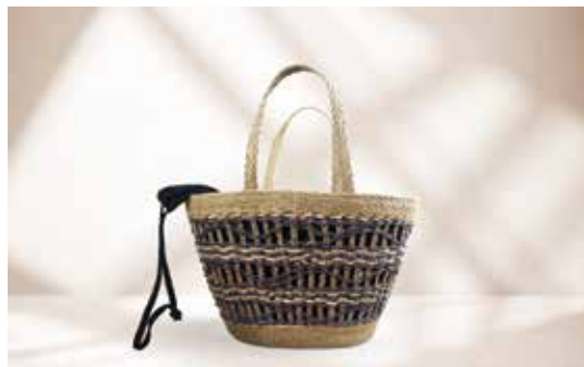
HTS002 Seagrass Eco Shopper Handmade