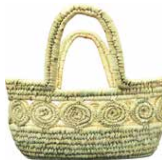
HSPS028 Eco Shopper