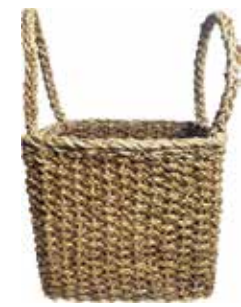
HSPS006 Seagrass Eco Shopper Handmade