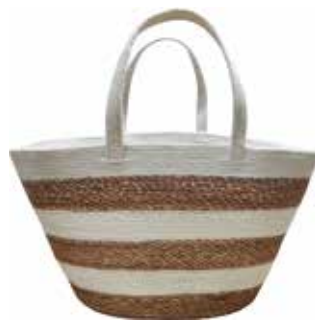
HSPS017 Eco Shopper