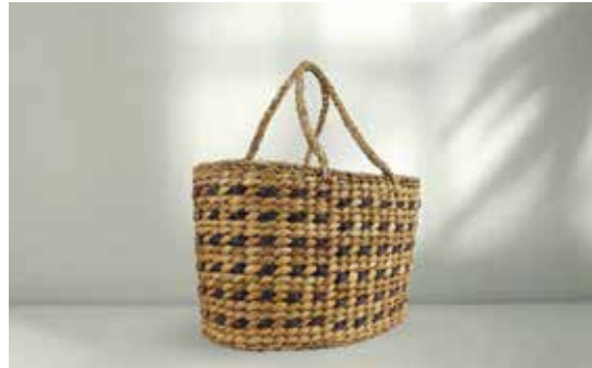
HTS015 Seagrass Eco Shopper Handmade