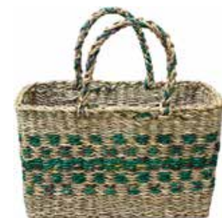
HSPS009 Seagrass Eco Shopper Handmade