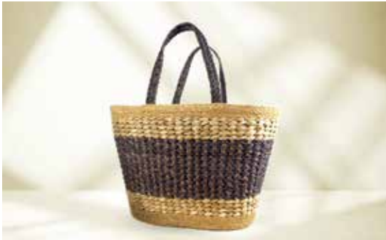
HTS014 Seagrass Eco Shopper Handmade