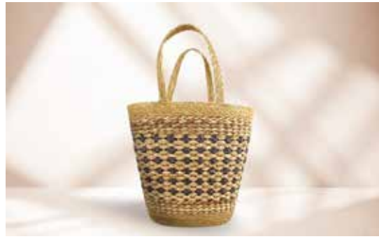
HTS009 Seagrass Eco Shopper Handmade