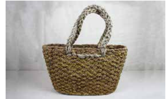
HTS012 Rice Straw, Jute Eco Shopper Handmade

L: D 45x23 x B 30x20 x H 27, h 22x17 cm S: D 40x18 x B 28x16 x H 23, h 22x17 cm