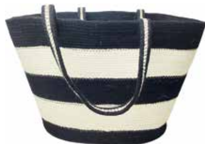
HSPS022 Eco Shopper