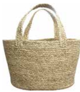
HSPS026 Corn Leaf Eco Shopper Sewing