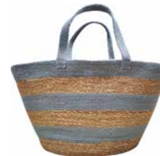
HSPS018 Eco Shopper