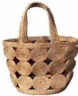
HSPS018 Eco Shopper