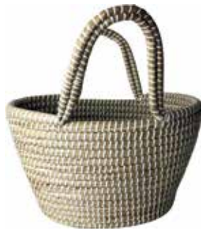
HSPS027 Eco Shopper

L : D 35 x B 25 x H 30 cm M : D 25 x B 20 x H 25 cm